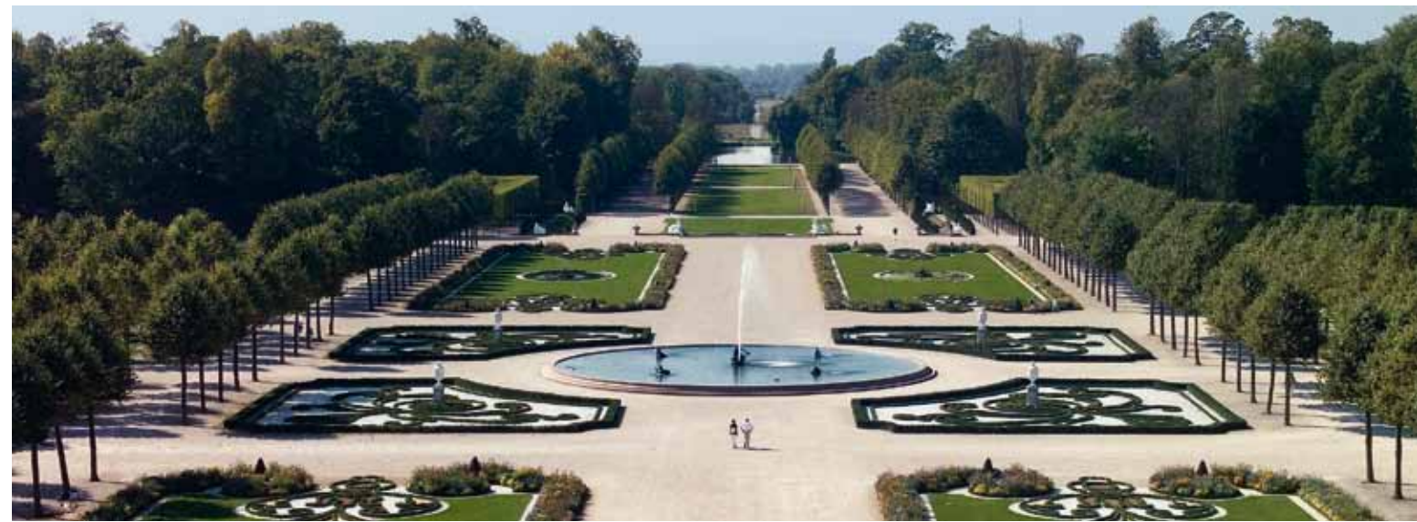
👑 Stately and elegant: the formal French garden is Schwetzingen's centrepiece

Schwetzingen Palace reached the height of splendour under the Prince Elector Carl Theodor. He instructed the leading landscape architects of the age to design the gardens, including Nicolas de Pigage and later Friedrich Ludwig von Sckell, with assistance from many renowned artists. From 1749 onwards, they created a masterpiece of rare beauty and rich variety. The central part of the gardens, including the Zirkelbauten (wings of the main building, which form a semi-circle), leafy avenues and a circular parterre, is laid out geometrically, with a focus on symmetry and order. In the late 18th