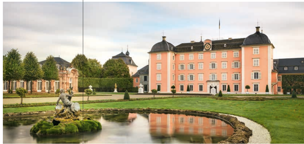
👑 🏛️ View from the Arion Fountain to the central building: The core of the palace was originally a knights' moated castle

Schwetzingen's palace garden is a cultural monument of European distinction, featuring well over 100 sculptures within its wonderful and surprising grounds. Picturesque structures lure visitors into strange and distant lands. The “Temple of Apollo”, a small, round building, houses a statue of the ancient Greek god of light and the arts, playing the lyre. The bath house is also worth a visit: a private haven in an elegant garden, and built like an Italian villa. And, most spectacularly the park's “Turkish Garden” boasts a mosque designed by Nicolas de Pigage, the only structure of its kind in a German garden. Ornamented with oriental details, the late-Baroque building was purely decorative and served no religious purpose.