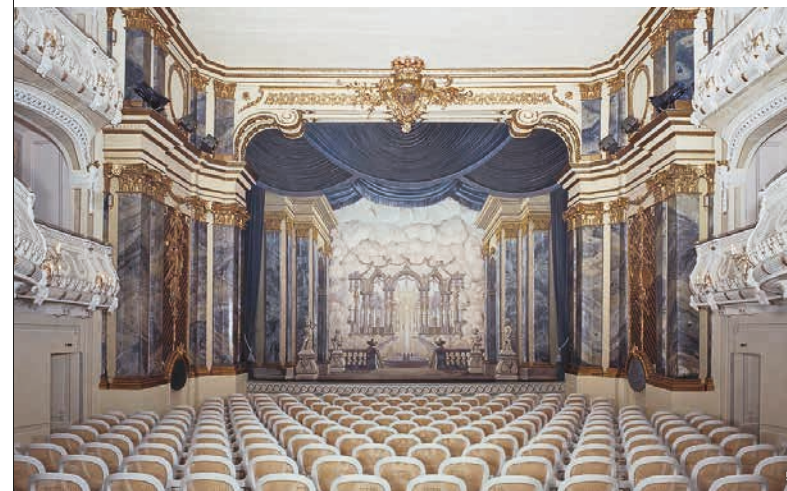
👑 🏛️ A worthy stop in the curved outbuildings: The grandiose palace theater and the lapidarium with the priceless original garden statues (left)

The palace rooms are furnished with pieces from the 18th and early 19th centuries. One spectacular feature in the palace is the prince-electors' court theater in the northern curved outbuilding. This “Rococo Theater” is still used for performances to this day. It is the oldest surviving gallery theater in Europe.