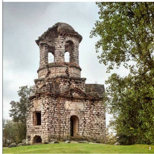
👑 🏛️ The Temple of Mercury is the newest building in the gardens; its architectural style was inspired by Roman tombs

Schwetzingen Palace reached the height of splendor under Prince-Elector Carl Theodor. He instructed leading landscape architects of the time to design his grounds, among them Nicolas de Pigage and later Friedrich Ludwig von Sckell. They began construction the large-scale project in 1749 and, supported by the most prominent artists, created an exceptionally beautiful artistic synthesis and variety. The central gardens boasts curved structures,